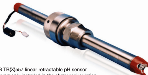
ABB TB(X)557 linear retractable pH sensor is commonly installed in the slurry recirculation line of the limestone scrubber.

The measurement point is typically in the slurry recirculation piping of scrubber. The flat glass electrode and Wood Next Step reference design best fit this application. The flat glass will minimize damaging abrasion from the abrasive slurry. The Wood Next Step reference provides the most effective solution against scaling and plugging of the junction. Commonly these sensors offer more than twice the lifetime of conventional double junction pH sensors. Materials are generally titanium or Hastelloy C because of the corrosive nature of the process.