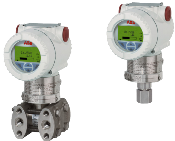
2600T pressure transmitters

ABB's 2600T family of pressure transmitters and sensors are available in a wide variety of configurations. Our all-stainless steel versions are field-proven in off-shore applications and feature unique features such as finger-tip through the glass operation, built-in back-up configuration storage, easy to change electronics modules and plugged impulse line detection.